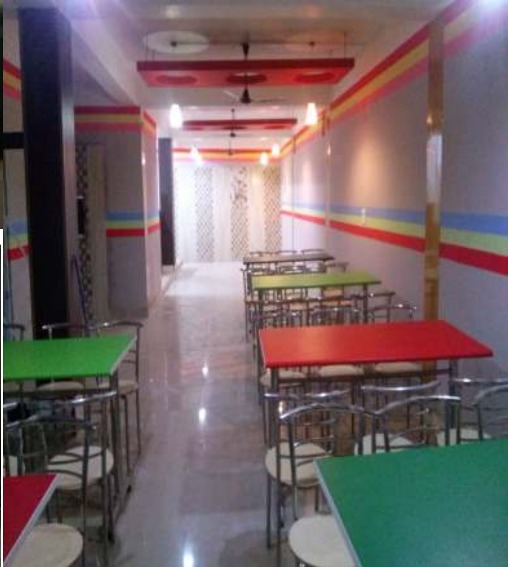
Picture same place after work completion