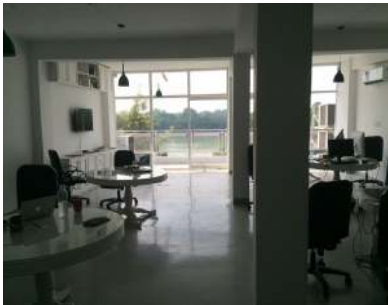
Work Stations Made and Installed