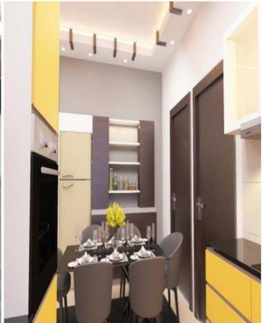
Work of Dining and Kitchen on Completion