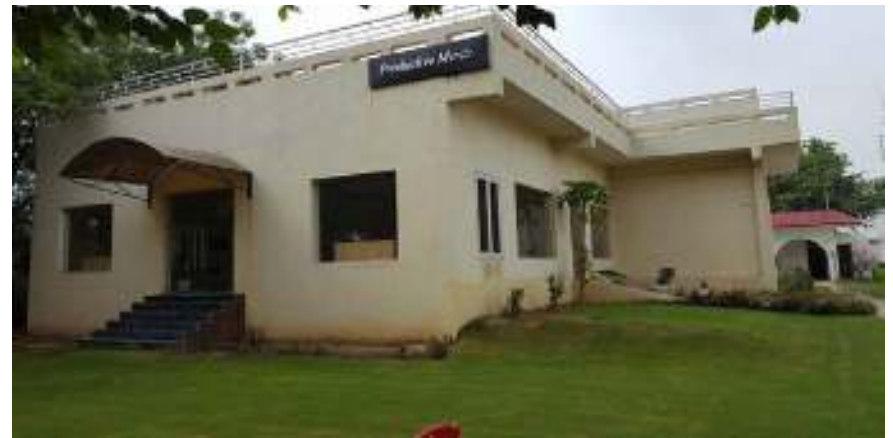
Work in Progress Pictures