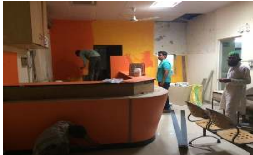
Work in Progress Picture