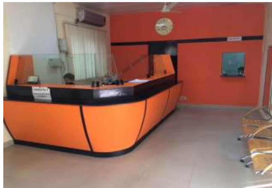
Work Completion Photograph of Same Place