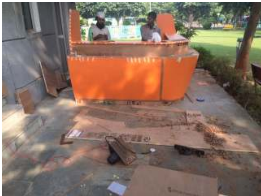
Work started at Reception Counter