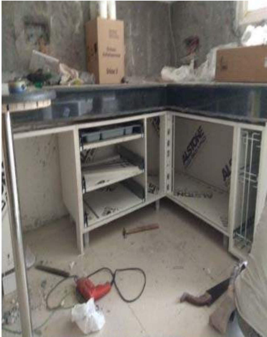
Work of Dining and Kitchen in Progress