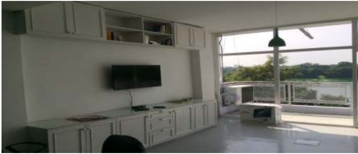
Cabinets, Flooring, POP, Raceway, Lighting work Complete