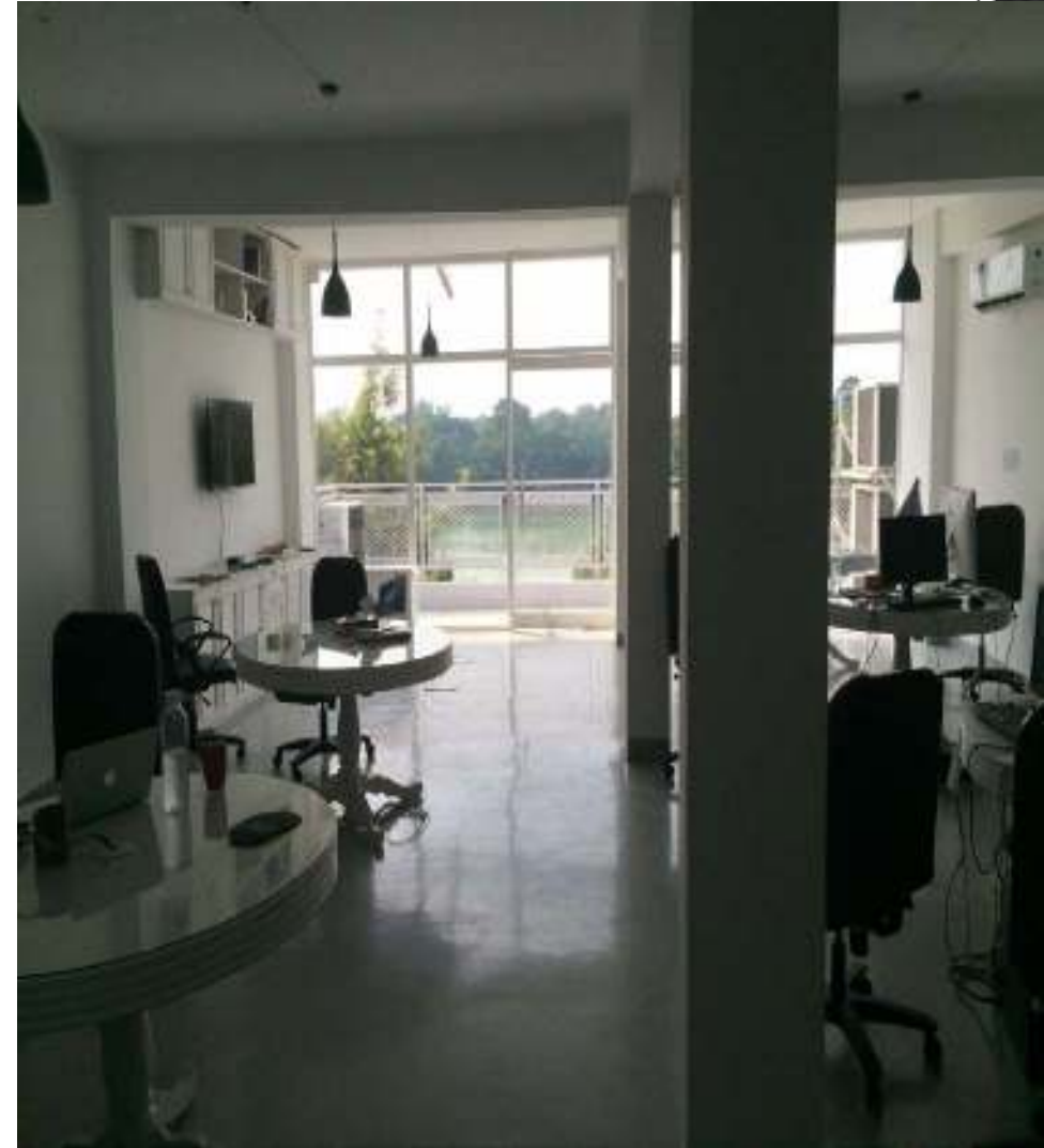
Same Place after Completion