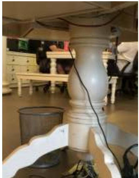
Artistic work Stations Installed along With Race Way