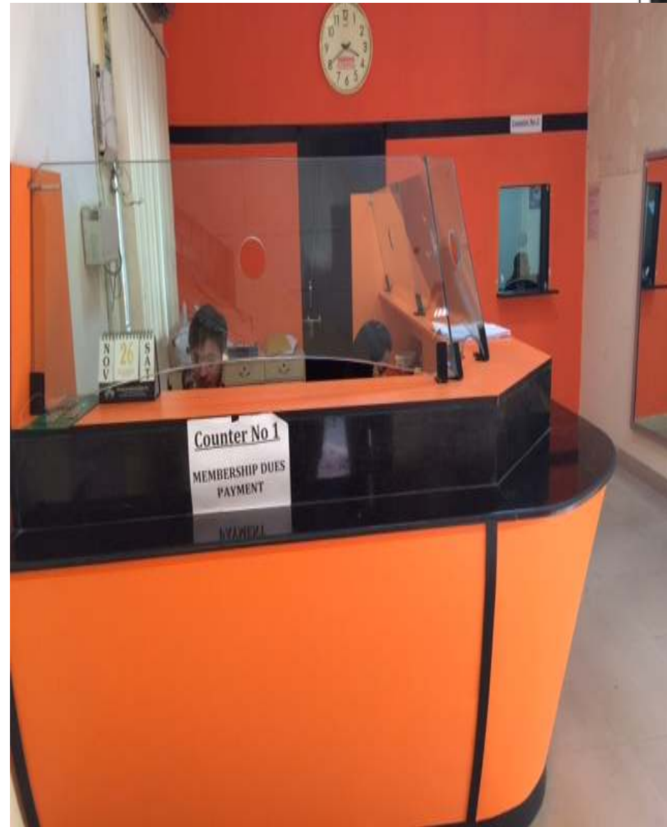
Work Completion Photograph of Same Place