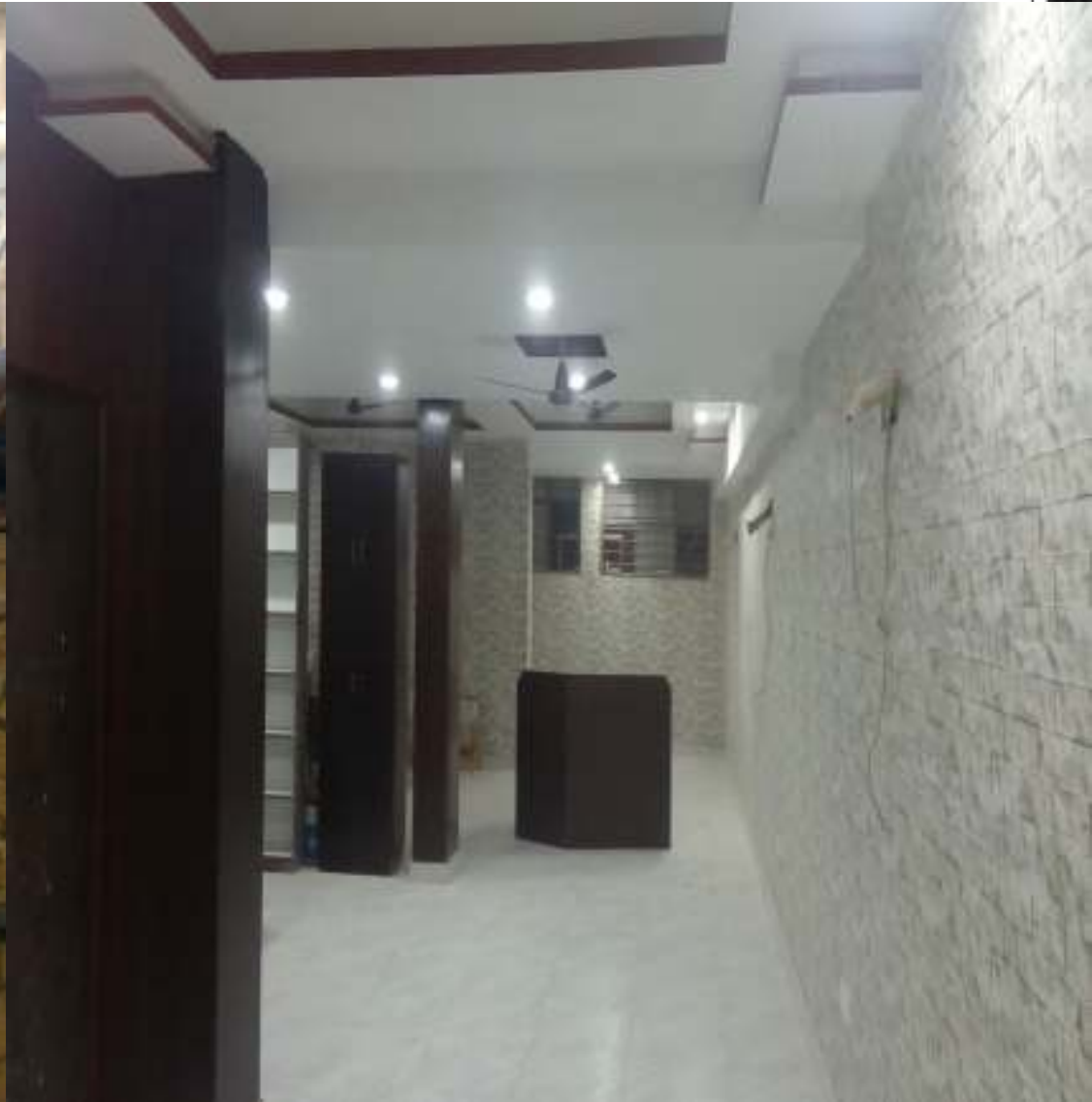
Work in Progress Pictures