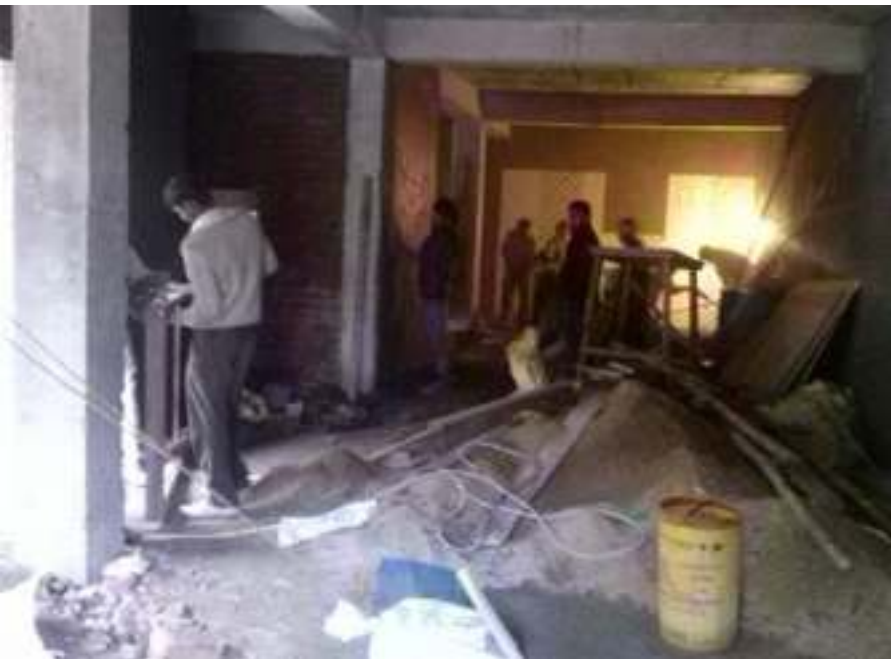
Work in progress pictures