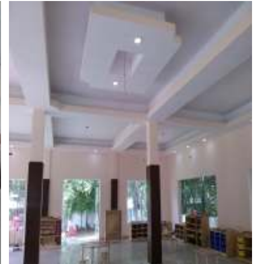
Work in Progress Pictures