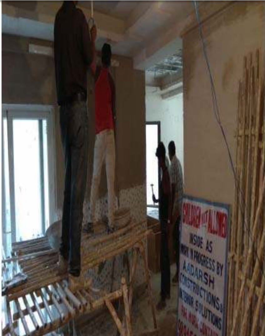
Work of Drawing Room in Progress