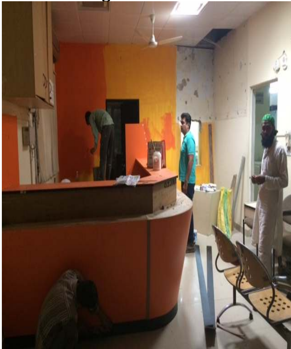
Work in Progress at Reception Counter