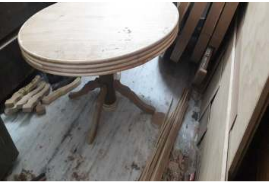
Work station Making at our own work shop