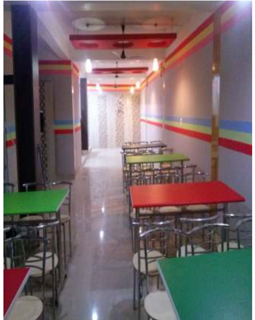
Work in Progress Pictures