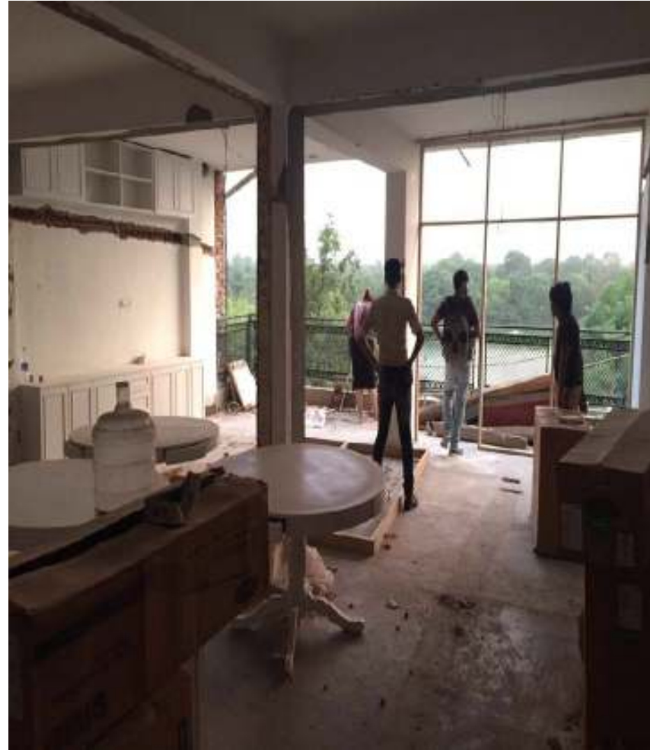
Work in Progress Photograph, Installation of Raceway and POP Works