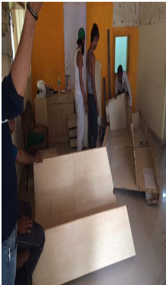
Work Started at Reception Counter