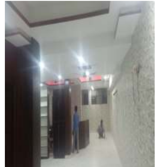
Work in Progress Pictures