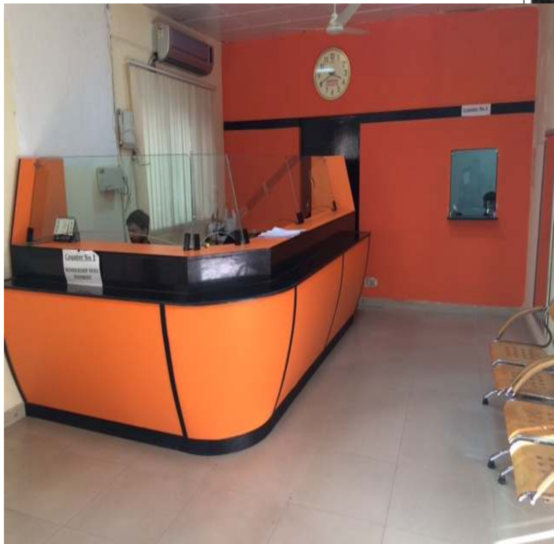
Work Completion Photograph of Same Place